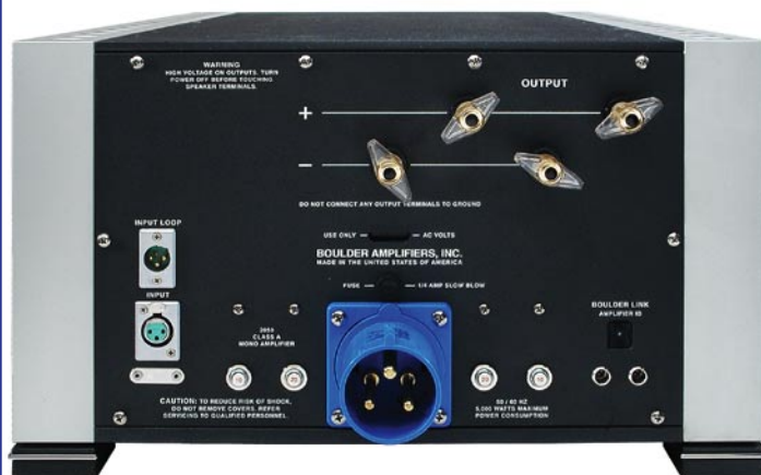
Ultra-high current power connector

Easy to connect, rugged, high current, speaker terminals require no tools