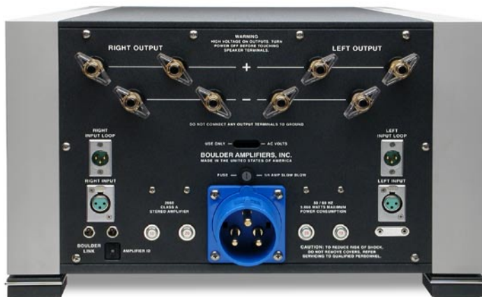
Ultra-high current power connector

Easy to connect, rugged, high current, speaker terminals require no tools